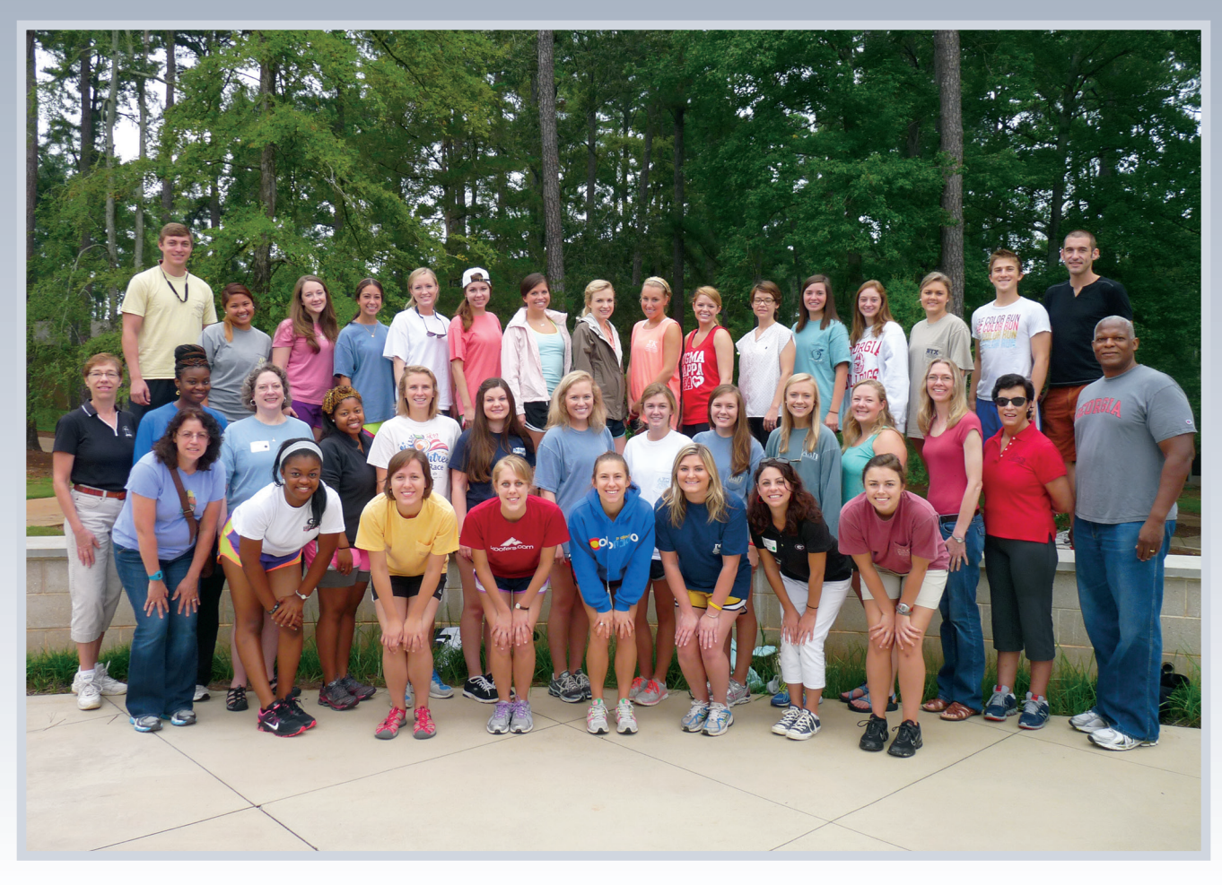
The 20th anniversary of Leadership FACS was held in August at Rock Eagle 4-H Center with 31 student leaders participating.